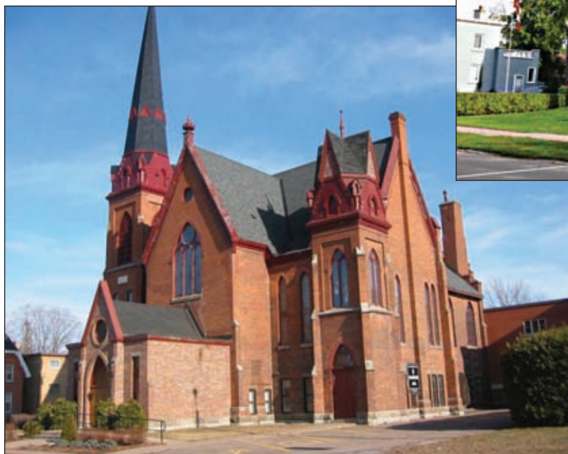
Calvin United Church