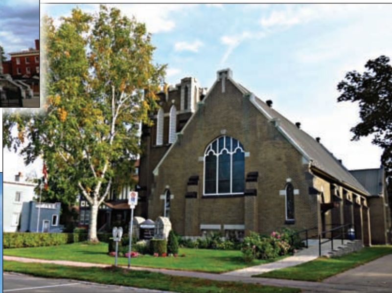
Holy Trinity Anglican Church