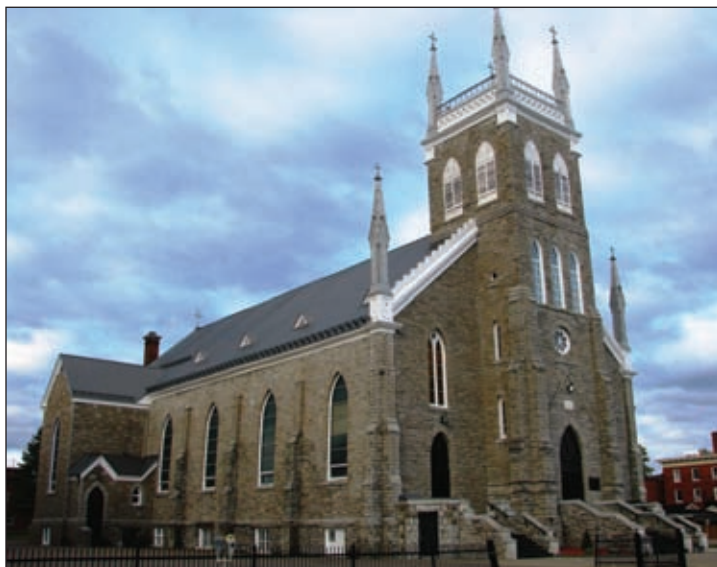
St. Columbkille Cathedral